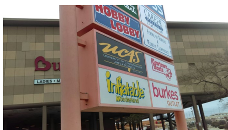
San Antonio (4522 Fredericksburg, A-85)