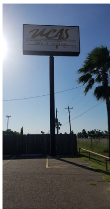
La Joya, TX