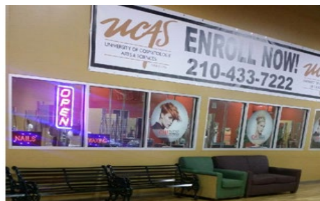
San Antonio (910 South East Military Drive, Suite 100)