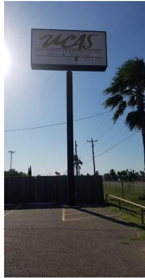
La Joya Campus