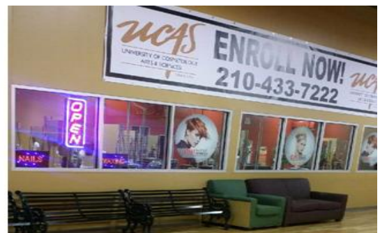
San Antonio (Pica)