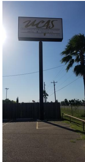
La Joya Campus