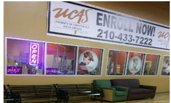
San Antonio (Pica)