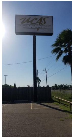
La Joya Campus