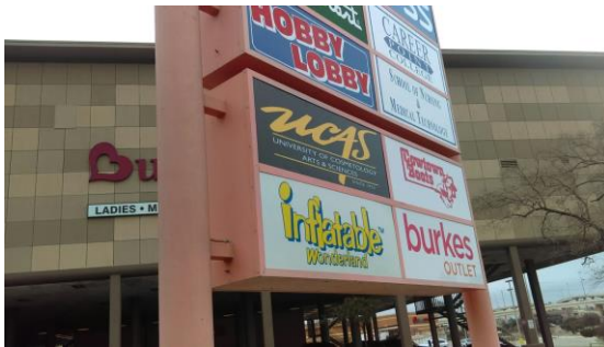
San Antonio (410)