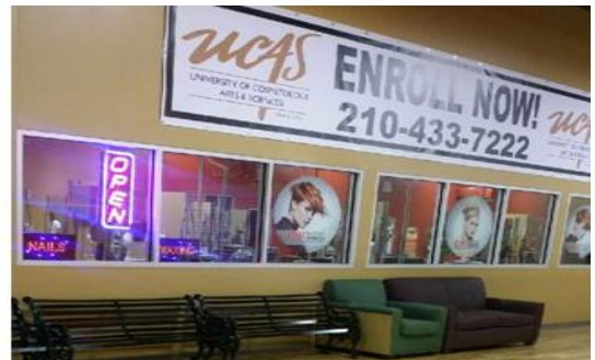
San Antonio (Pica)