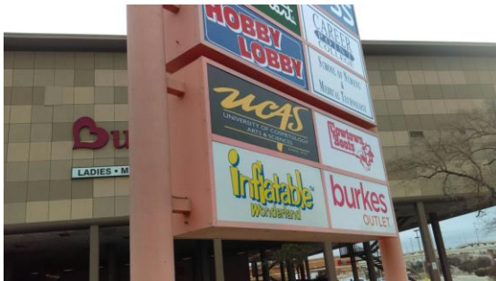
San Antonio (410)