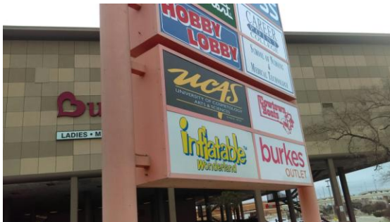
San Antonio (410)