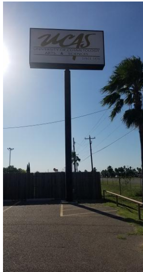
La Joya Campus