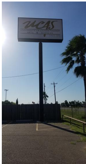
La Joya Campus