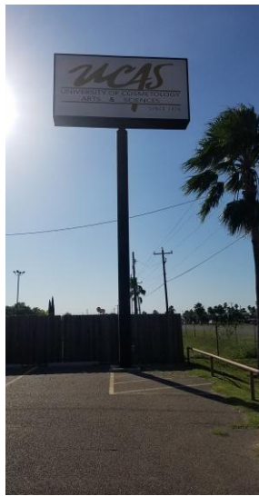
La Joya Campus