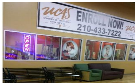
San Antonio (Pica)