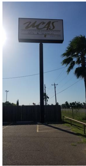
La Joya Campus