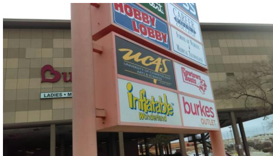
San Antonio (410)