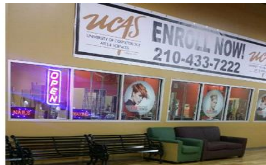
San Antonio (Pica)