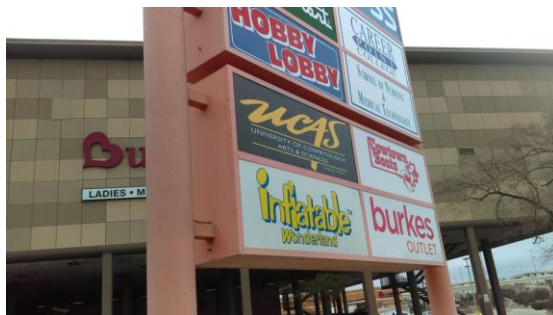
San Antonio (410)