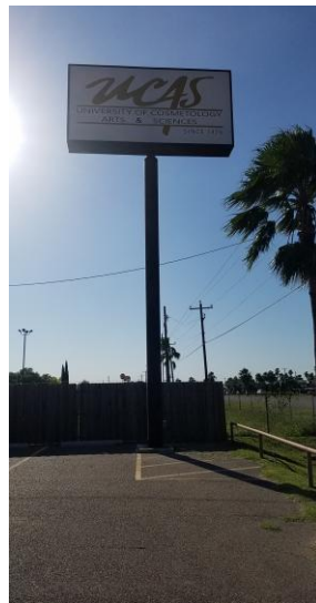
La Joya Campus