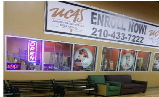
San Antonio (Pica)